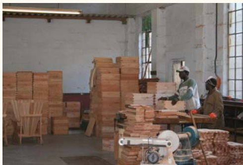
Bulembu workers make bee hives

2008 was a year for laying foundations and properly establishing production processes and infrastructure. Although Bulembu Honey experienced rapid growth, quickly making it the largest producer of honey in the country, growth now needs to be shifted and focused on sales.