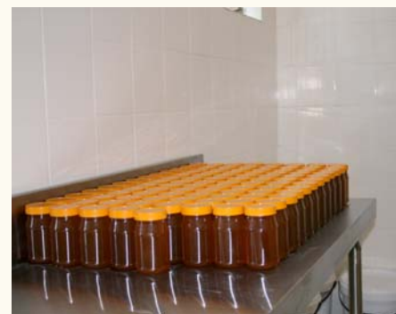
First batch of Bulembu Honey!

Impacts like this are only possible because of thoughtful contributions from foundations like the Golder Trust for Orphans. Your gift makes it possible for us to continue our vision to create a totally self-sustaining community, restoring health, education, commerce and providing care for children.