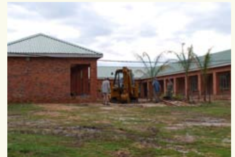
The crèche courtyard.

All painting is completed except for the treating of the protruding trusses and timber, which are currently in progress.