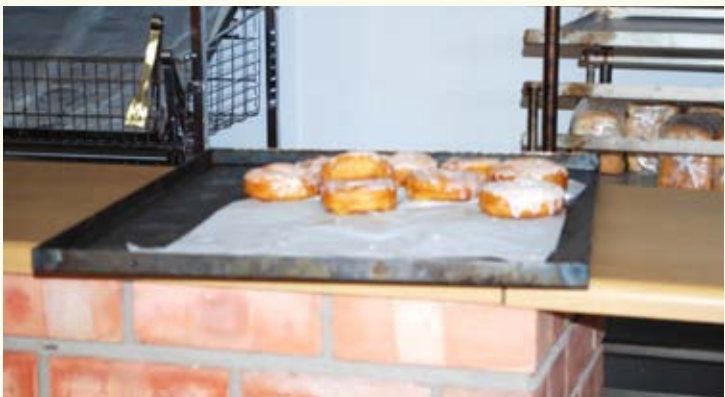
Bulembu bakery goodies!

Although loaf sales are not in line with initial projections, overall sales and incomes are currently exceeding projections, due to the sales of other confectionary items, which were not in the initial plan. These items include; buns, rolls, doughnuts, muffins and scones.