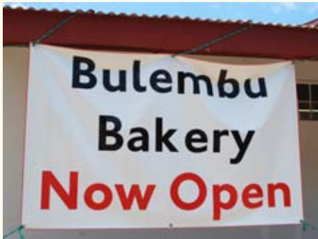
Opening of the Bulembu bakery.

Click here to watch a video about the bakery, which opened in November 2009.