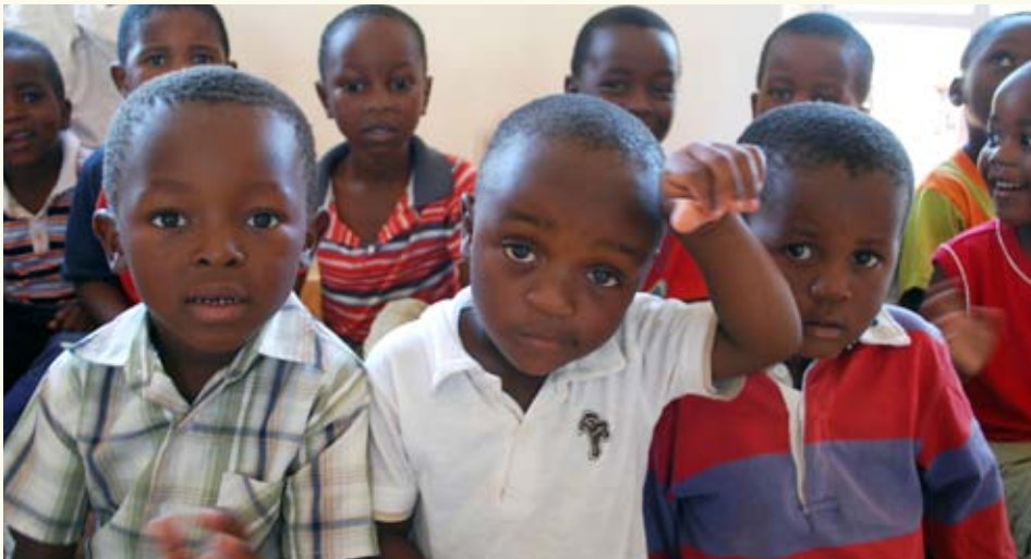
Happy crèche students!

In November 2009, a group of Golder employees from around the world spent a week in Schulzendal, South Africa, preparing a crèche for its opening day. The construction of the crèche, about $100,000 USD, was funded by the Golder Trust for Orphans in late 2008 and throughout 2009.