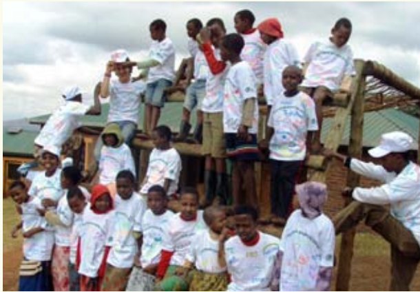
Rhotia Valley Kids having fun in their T-shirts!

Rhotia Valley Tented Lodge and Children's Home is a project near Arusha, Tanzania being funded by the Trust. In 2009 the Trust helped install solar water heaters to the lodge and children's home. In 2010, the Trust will invest almost $100,000 USD to help build a bakery