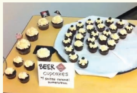
Pirate cupcakes for sale in Redmond!

The Redmond office will be donating $100 USD to the Trust in Gary's name in recognition of his culinary skills, and sales of baked goods and donations raised $316 USD for the Trust.