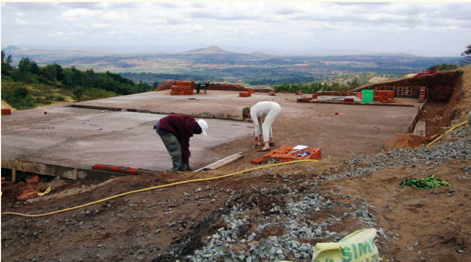
The bakery foundation gets started.

In May 2010, the Golder Trust for Orphans Trustees approved a proposal submitted by Rhotia Valley Tented Lodge and Children's Home requesting $90,000 USD to purchase the equipment and supplies needed to build and operate a bakery on site at the Lodge.