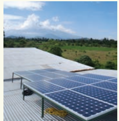
Solar panels installed on the roof.

The solar panels purchased by the Golder Trust for Orphans will supply FWS with enough energy every day to operate their lights, power the sewing machines used to make crafts that are being sold in the community to tourists and provide lights for evening community classes. They will help the residents learn, make money, and ultimately help the children for whom they are caring.