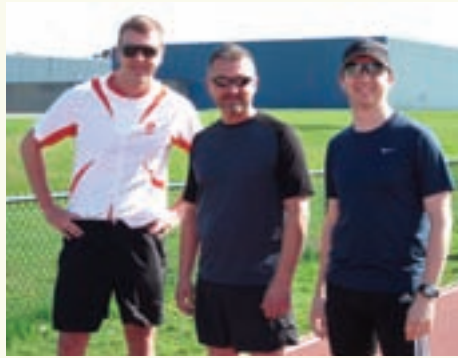
Montreal office employees ready to run!

for the team with the highest participation rate at the 1 mile distance. For each participant, the Montreal office social committee sent $15 CDN to the Golder Trust for Orphans.