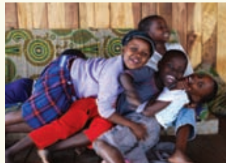
Happy girls having fun in the common room!

You can see the benefits of what FWS is doing the minute you walk into the village. Four happy girls sit in the common area. They watch a local group of pre-schoolers leave the pre-school class room. Laughter and smiles are everywhere. The women from the community who have volunteered to be house mothers are busy getting the kids ready for a communal lunch. Local farmers are learning how to grow crops in an environmentally sustainable way. A local worker is helping install the water capture system.