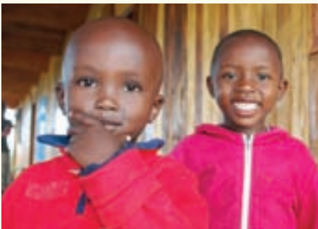
Happy boys ready for lunch!

Food Water Shelter (FWS) is a not-for-profit, non-denominational, non-governmental organisation established in 2005 that builds and manages sustainable and eco-friendly children's villages with education, social and health facilities for orphans, and vulnerable women and their children in developing countries.