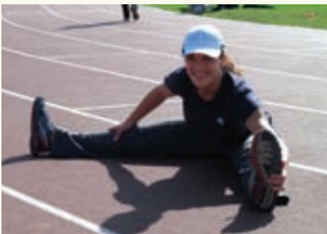
Happy relay team member.

The Milligan Mile was one of the activities, and it was related to Golder Trust for Orphans. There were two medals related to this activity: the first for the relay race (3x1 mile, with 3 runners, including at least one woman) and the second