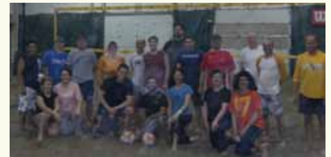
Windsor Staff Play Volleyball!

On Saturday April 4th, the Windsor Office hosted an Indoor Sand Volleyball Tournament to raise funds for the Golder Trust for Orphans. The four participating teams of clients and Golder staff raised $1600! Everyone had a great time.