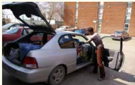
Saskatoon staff take bottles to the recycle depot!