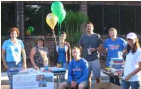
Gainesville employees at the Golder Trust Garage Sale!