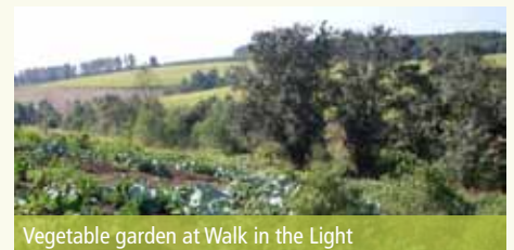
Vegetable garden at Walk in the Light

in the area, complete with bathrooms and a small kitchen, and one cannot help but laugh at the smiling elephant peering at you from its portrait on the outside walls. There is also a library, recycling bins, a jungle gym and even a climbing wall.