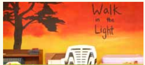
Painted wall at Walk in the Light