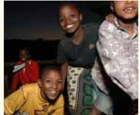
Happy children at Rhotia Valley, Tanzania.

For more information about Bulembu, visit www.bulembu.org .