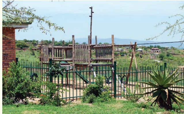
The playground built by Golder volunteers in 2009, now fenced and leveled with sand.

In 2009, the Golder Trust for Orphans invested $200,000 in the building of a school in Schulzental, South Africa. The ongoing school costs are funded by a samp mill on the property at Schulzental, which was also funded by the Trust for Orphans. Golder volunteers visited the school in November, 2009 to paint the school and build a jungle gym on time for the school's opening.