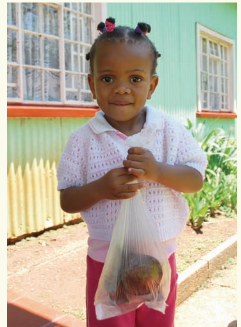
One of the Bulembu Babies Holding Muffins from Bulembu Bakery.