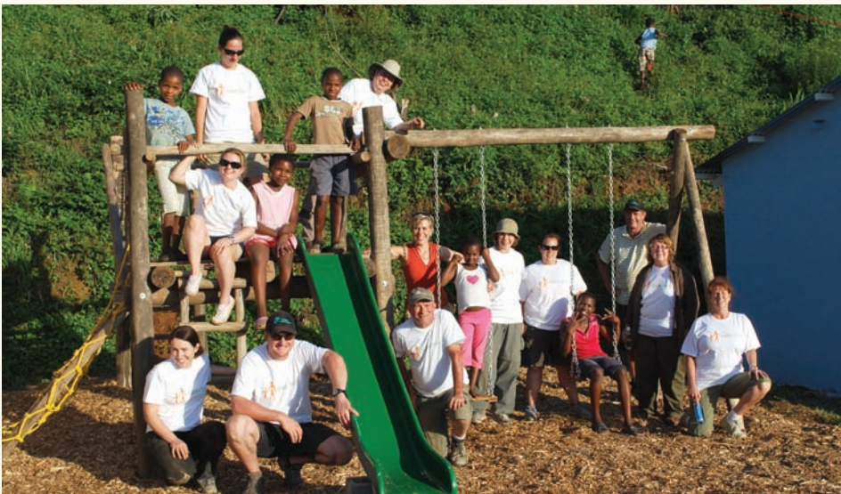
Success on the final day! Playground built in Bulembu!

A team of Golder volunteers, who funded their own travel and time to participate in the 2010 Golder Trust Volunteer Project, had a very successful experience in Bulembu, Swaziland in the second week of November.