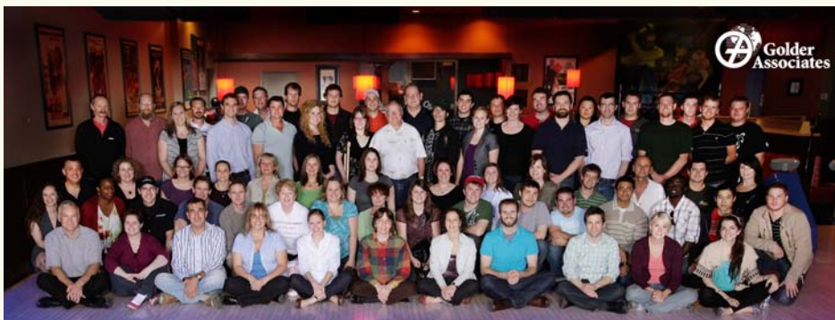
The Essakane Gold Project Team

This generous donation will go a very long way to making a difference to the lives of African children!