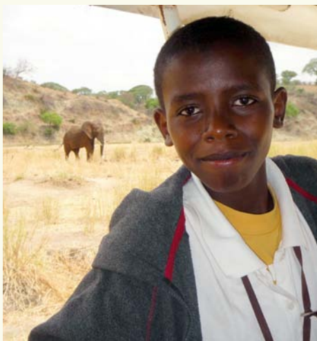
A FWS kid enjoys seeing his first elephant!

This wonderful series of Christmas gifts and festivities were entirely thanks to the generosity of the Golder Trust for Orphans and have made this festive season a wonderful end to yet another exciting year. On behalf of the mamas, kids and staff at FoodWaterShelter would like to say a huge "Asante Sana" ("Thank you" in Swahili) and Merry Christmas!