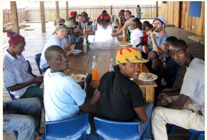
Kids, employees and volunteers enjoy their holiday lunch together.

the perfect site for our grand safari. Hushed screams of excitement were shared between the two minibuses heavily laden with excited passengers, wary of scaring off the elephants, giraffes, impala, ostrich and warthogs grazing within meters of their windows. A harmless baboon encounter at lunchtime saw one slightly shaken volunteer, one very full baboon and 19 laughing kids.