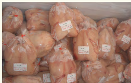
Hope Farm chickens for sale.

This project was the pilot project of Thembisa and remains an essential part of the organisation. It partially relieves the burden on the caregivers who are feeding many children, and also provides a sense of belonging to Thembisa. The project receives food from local churches, individuals and private companies which it distributes every Wednesday. The project also has a successful vegetable garden.