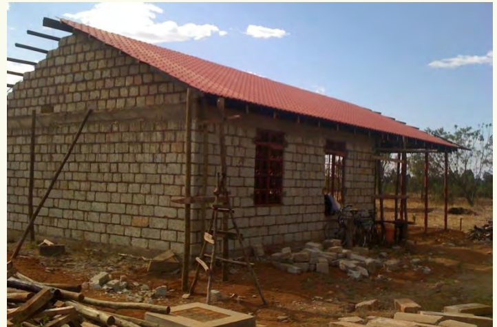
The laundry facility is almost finished being built.

The laundry is almost done! A group of local workers were hired to dig the foundation, build the bricks and construct the laundry house, providing income for 6 local workers. The final laundry will contain soaking basins, washing basins, an indoor drying area and an ironing area.