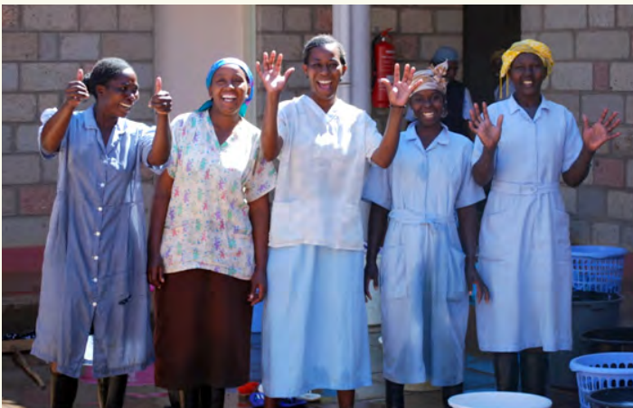
The washing ladies, happy to hear a new laundry will be built!

In 2010, the Golder Trust for Orphans donated $6,500 USD to Lewa Children's Home for the construction of a new laundry. Prior to the donation and construction, doing laundry at Lewa, which is home to over 100 orphaned children, most of whom are between the ages of 0 and 5, was a challenging daily task.