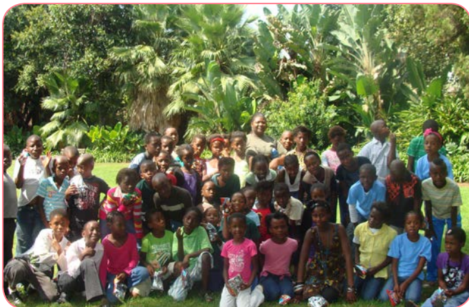
8 April 2011.... 60 Orphan and Vulnerable Children during their outing to Pretoria Zoo.