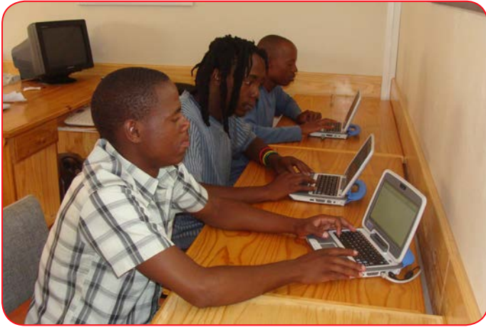
23 March 2011..... Some of the youths benefiting from the Youth Online Facility provided by St Joseph's.