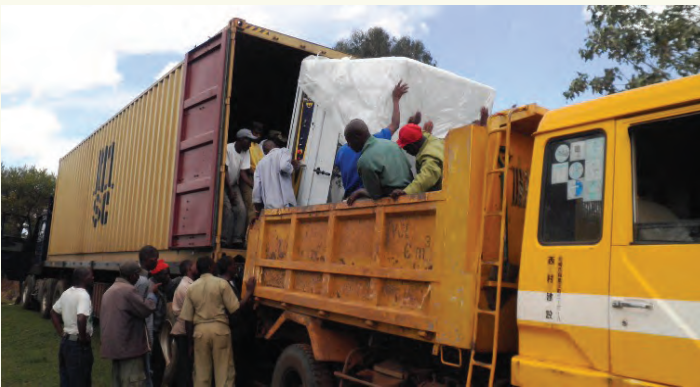
The new bakery equipment arrives to Rhotia Valley!

In early May, 2011, the final crucial component of the Rhotia Valley Bakery finally arrived at Rhotia Valley Tented Lodge and Children's Home.