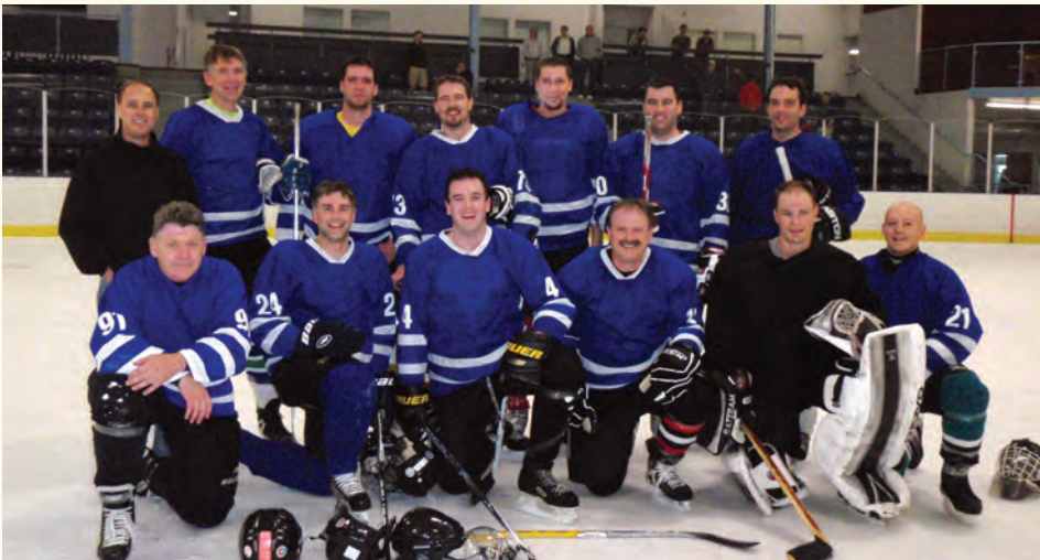
The "Tavares Blue Thunder".

Fun was had by everyone, and $380 was collected as donations to the Trust!