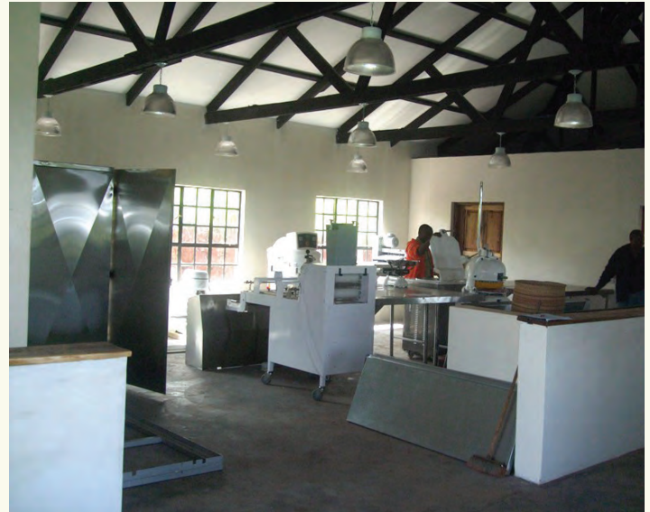
The new equipment gets set up.

The bakery structure was built in late 2010 ( story in September 2010 newsletter ), but the equipment, which was purchased from South Africa, was still to arrive and had been held up in Customs in Tanzania. The day that the container arrived was a very exciting day in Rhotia Valley.