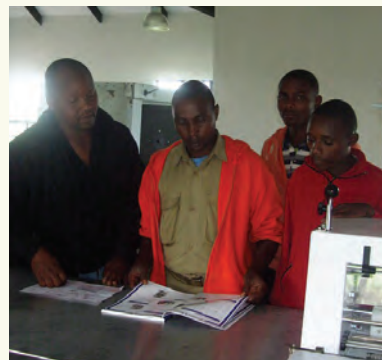
The baker and staff review equipment instructions.