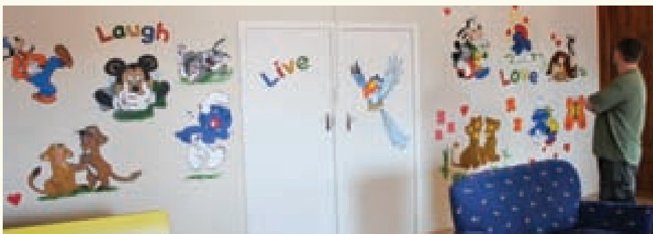
Clockwise: New mural the team painted in a Bulembu Babies house, Golder staff get close with a happy Bulembu baby, One of the lucky babies and loving house mothers at Bulembu Babies.