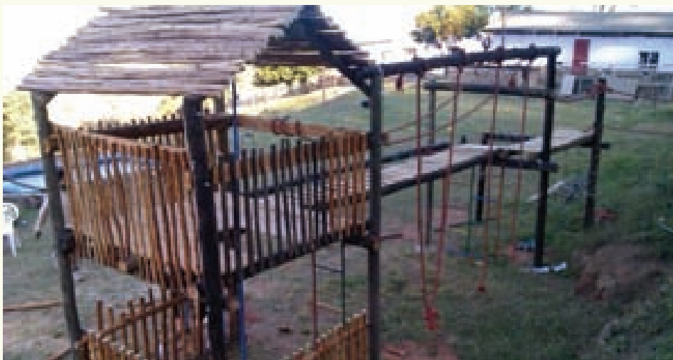
Old barn materials turn into a new jungle gym.