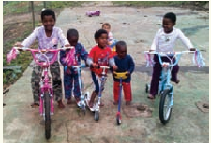
Hope Farm kids enjoying their new bicycle area!

The barn area is now a bicycle area. I was blessed with some money on my birthday and we bought the children new bicycles and scooters for the younger kids.